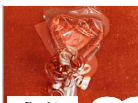
Chocolate Heart Sucker